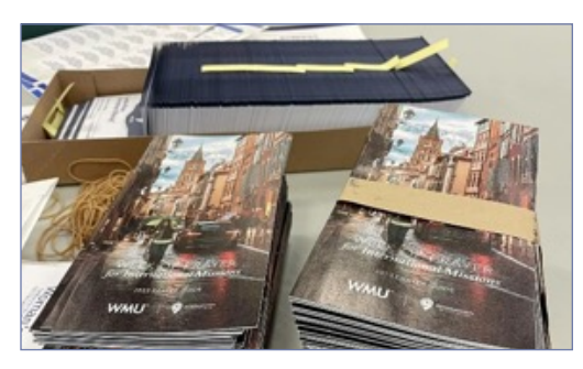
Prayer guides and envelopes.