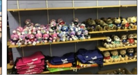
Stocking the Store for summer camps.