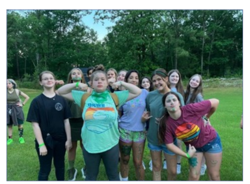
Girls just wanna have fun!