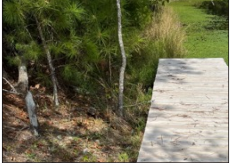
New dock at the lake.

Forty years of wear and tear on the Multipurpose Building floor had taken its toll and needed replacing. We were able to purchase a beautiful new floor because of generous giving from attendees at our WMU Missions Encounter and Annual Meeting and South Carolina Baptists. The Multipurpose Building has many uses during camping season, including daily worship services, camptivities, and Bible studies. During the off-season, the Multipurpose Building is also used for meetings and activities by groups.