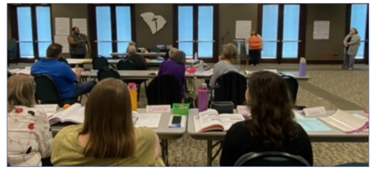
Participants worked together to research and present signs and symptoms of different mental health challenges throughout the training.

On May 24, 2023, SC WMU held a Mental Health First Aid training in Columbia. Twenty-one participants from across the state attended an eight-hour certification course to learn how to identify, understand, and respond to signs of mental health and substance use challenges. Through this training, participants became more educated and equipped to help those in their churches and communities who may be experiencing mental health challenges.