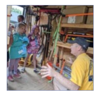
Learning about Disaster Relief .