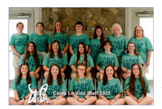
Full time female staff for the Summer of 2023.