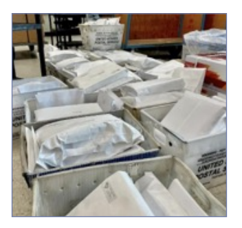
Buckets and buckets of orders waiting to be mailed out.

WMU staff packing the materials to send to the churches.