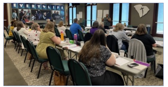
The course instructor taught the participants how to recognize and respond to various mental health challenges individuals may face.