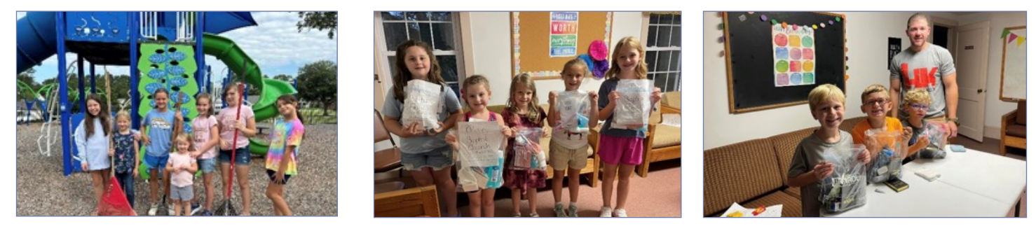
Cleaning up the playground.

The theme for the August 24, 2023, event was "Operation Education." Girls and boys across South Carolina served their local schools and communities as they demonstrated the love of God. A few churches that participated were: First Baptist, Honea Path; Oolenoy Baptist, Pickens; Fairview Baptist, Spartanburg; Deer Park, Charleston, and more! Other groups are planning a Children's Missions Day project later this year.