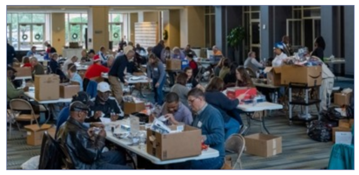
Each packet has to be checked to ensure proper items are included.

Each year the South Carolina Baptist Convention and South Carolina WMU partner to provide Christmas packets to every inmate in the South Carolina prison system. On December 5, 2022, 130 volunteers met at Shandon Baptist Church in Columbia to process over 23,000 packets to be distributed to inmates throughout the state during the Christmas season. Baptist churches and associations across the state collected and donated the packets. These simple gifts provide hope and show love to those incarcerated. It is a reminder that they are not forgotten.