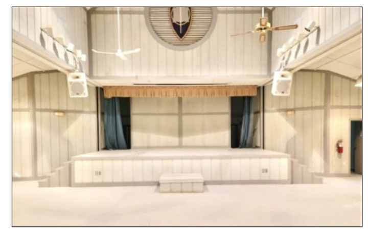
New floors in the Multipurpose Building.

Forty years of wear and tear on the Multipurpose Building floor had taken its toll and needed replacing. We were able to purchase a beautiful new floor because of generous giving from attendees at our WMU Missions Encounter and Annual Meeting and South Carolina Baptists. The Multipurpose Building has many uses during camping season, including daily worship services, camptivities, and Bible studies. During the off-season, the Multipurpose Building is also used for meetings and activities by groups.