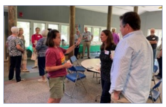
Visiting together is the focus of this day.