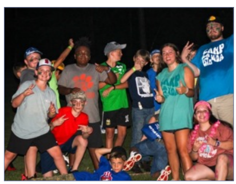
Coed games on a hot summer night!

The theme was "All Day, Every Day." We had 1,407 campers. The campers gave $3,834.50 through the Cooperative Program. Our campers came from 6 states. We had 49 program guests and 18 missionary/volunteer kids. We had about 40 volunteers. We had 26 female staff and 5 male staff.