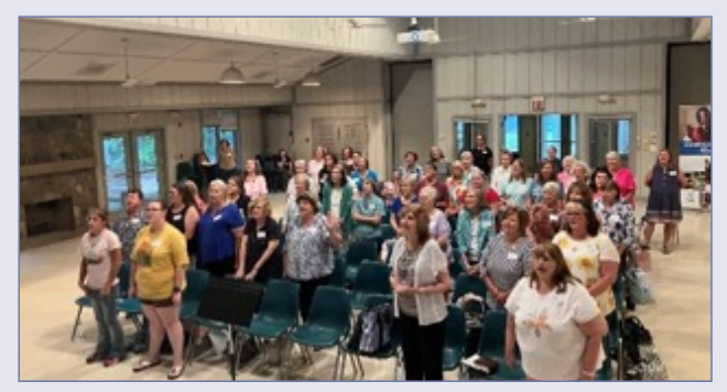
Attendees were led in worship prior to each session by three of our Camp La Vida staffers.

Church Leadership Development was held at Camp La Vida on August 18–19, 2023. For this weekend, 61 people gathered for times of worship, fellowship, and training in how to serve believers of all ages within their churches. In addition to age–level leadership training, attendees enjoyed break–out sessions focused on how to make disciples and live on mission in their contexts.