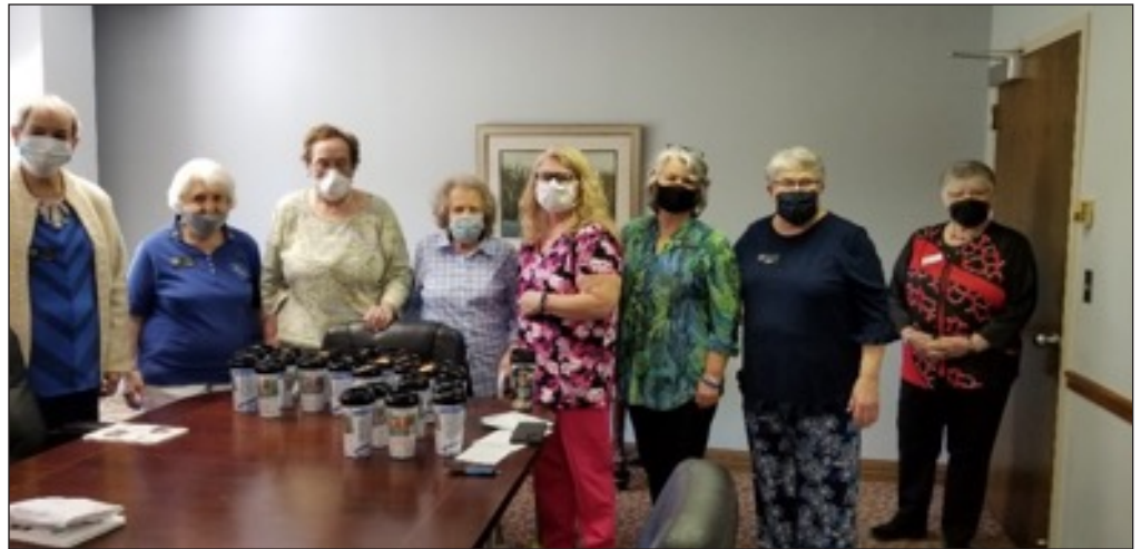
BNF members serving at Martha Franks