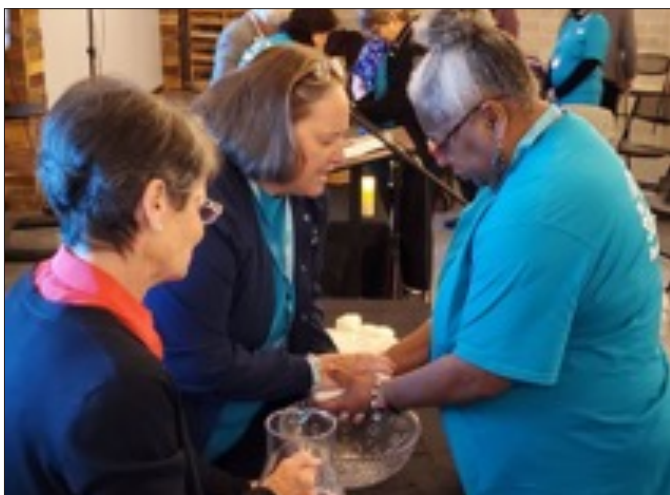
BNF members sharing in the Blessing of the Hands