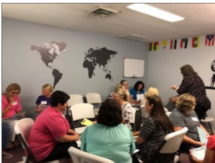
Women on Mission and myMISSION leadership conference.

Church Leadership Development was held in two locations on August 6 & 13 in 2022. Meetings were held at Fairview Baptist Church in Spartanburg and St. George Baptist Church in Orangeburg. 173 participated in the leadership conferences that were presented for each age level. We also offered specialized missions training.