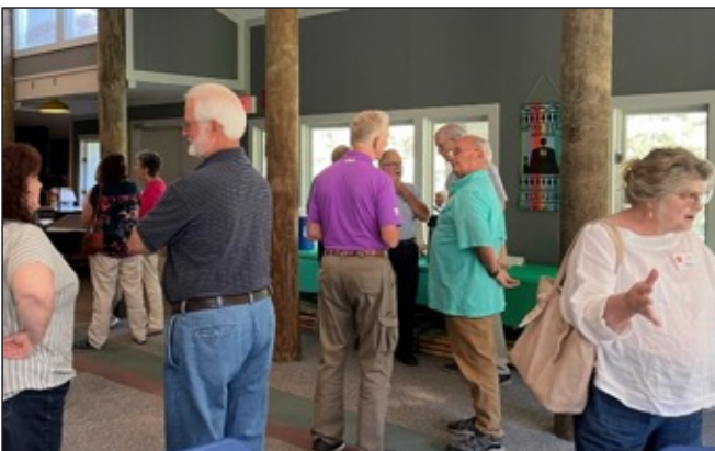
Missionaries enjoying fellowship during Missionary Day.

This year we had the unique opportunity to encourage new missionary parents with dinner and a special gift bag as their children were commissioned at the South Carolina Baptist Convention Annual Meeting in November 2021.