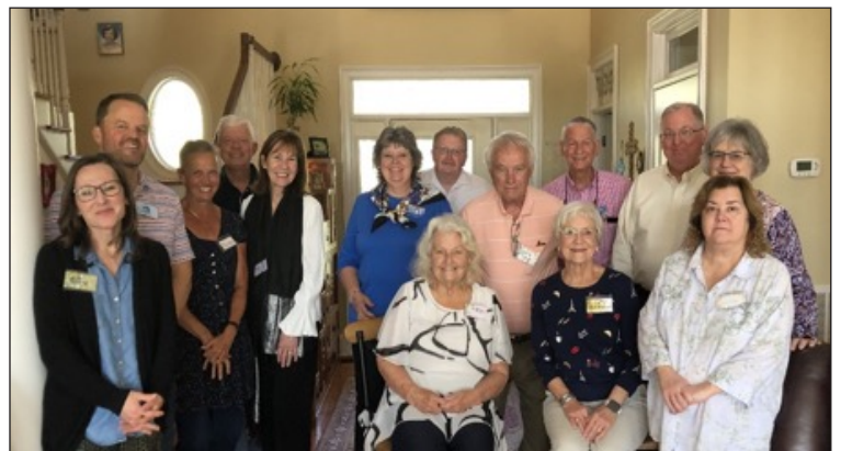
We are grateful for missionary parents and appreciate the opportunity to pray with them for their children.