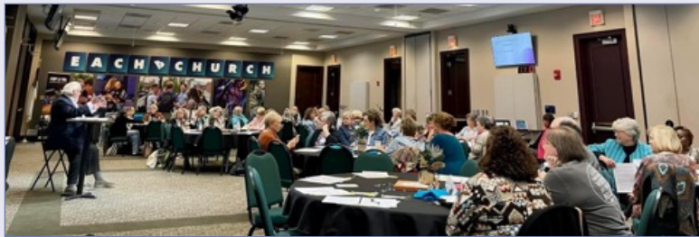
We had a great group of attendees.