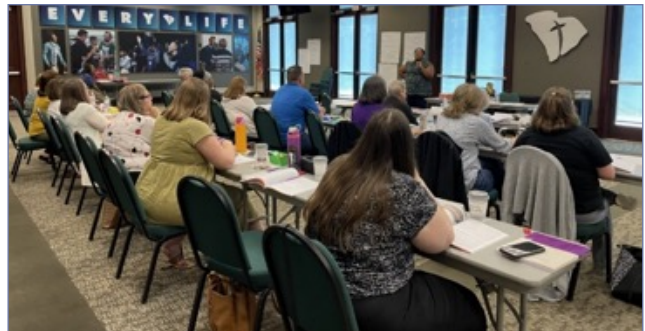
The course instructor taught the participants how to recognize and respond to various mental health challenges individuals may face.