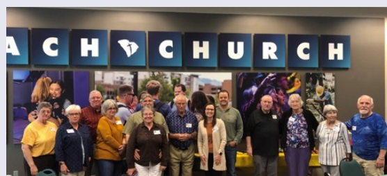
Missionary parents at their fall meeting.