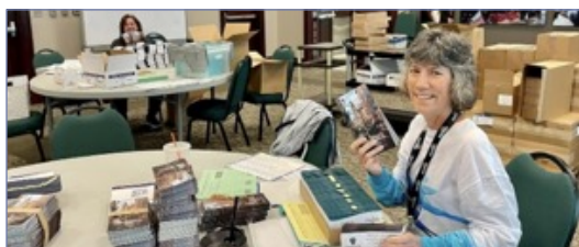
WMU staff packing the materials to send to the churches.