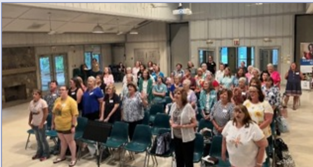
Attendees were led in worship prior to each session by three of our Camp La Vida staffers.

Church Leadership Development was held at Camp La Vida on August 18-19, 2023. For this weekend, 61 people gathered for times of worship, fellowship, and training in how to serve believers of all ages within their churches. In addition to age-level leadership training, attendees enjoyed break-out sessions focused on how to make disciples and live on mission in their contexts.