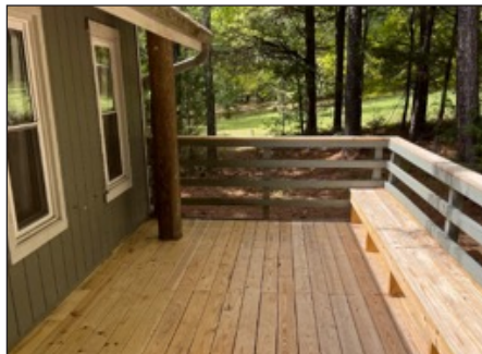
Repairs made on cabin decks.