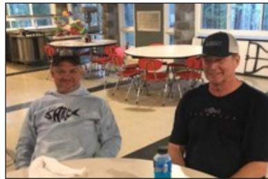
A few moments of rest.