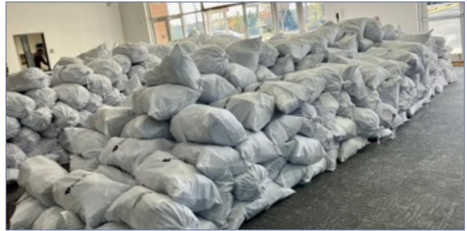
Bags full of packets ready for distribution.