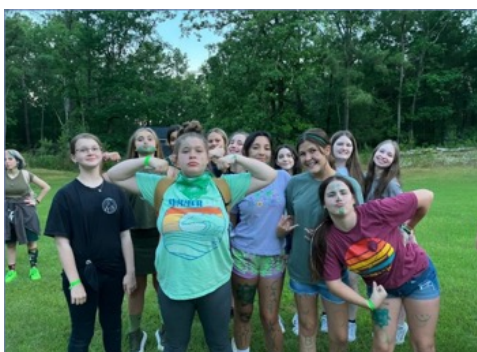
Girls just wanna have fun!