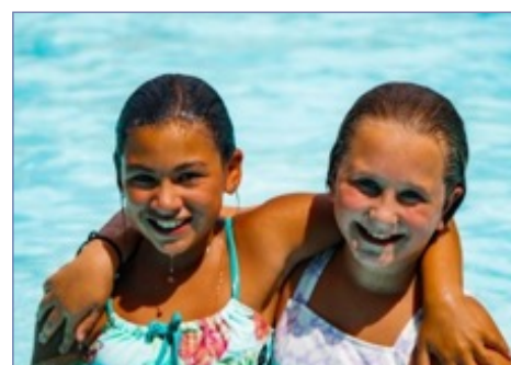
Pool time – cool down fun!