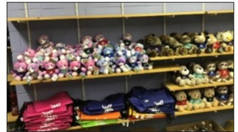
Stocking the Store for summer camps.