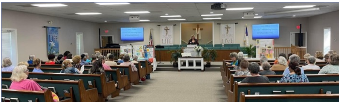
Most of our meetings were held in churches in each association.

We had a wonderful time visiting 37 of our associations for their WMU Spring Meetings. The purpose of gathering at these meetings is to inform everyone about missions education in the association, increase awareness of Southern Baptist missions, strengthen fellowship, and conduct associational WMU business. It was good seeing most of our associations holding spring meetings this year.