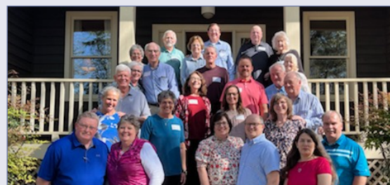
Missionary parents at their spring meeting.