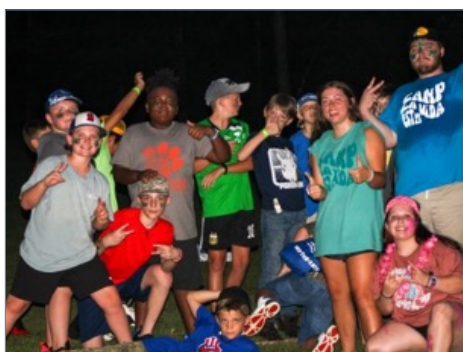
Coed games on a hot summer night!

The theme was “All Day, Every Day.” We had 1,407 campers. The campers gave $3,834.50 through the Cooperative Program. Our campers came from 6 states. We had 49 program guests and 18 missionary/volunteer kids. We had about 40 volunteers. We had 26 female staff and 5 male staff.