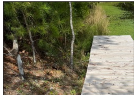
New dock at the lake.

Forty years of wear and tear on the Multipurpose Building floor had taken its toll and needed replacing. We were able to purchase a beautiful new floor because of generous giving from attendees at our WMU Missions Encounter and Annual Meeting and South Carolina Baptists. The Multipurpose Building has many uses during camping season, including daily worship services, camp activities, and Bible studies. During the off-season, the Multipurpose Building is also used for meetings and activities by groups.