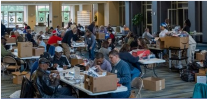
Each packet has to be checked to ensure proper items are included.

Each year the South Carolina Baptist Convention and South Carolina WMU partner to provide Christmas packets to every inmate in the South Carolina prison system. On December 5, 2022, 130 volunteers met at Shandon Baptist Church in Columbia to process over 23,000 packets to be distributed to inmates throughout the state during the Christmas season. Baptist churches and associations across the state collected and donated the packets. These simple gifts provide hope and show love to those incarcerated. It is a reminder that they are not forgotten.