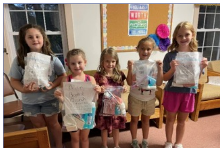
GAs & RAs packed care packets to give out.