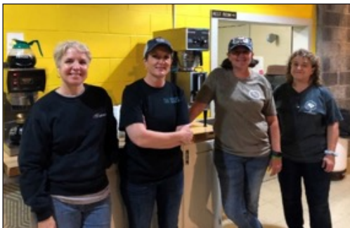
Feeding our volunteers.