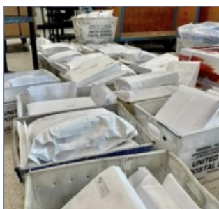
Buckets and buckets of orders waiting to be mailed out.