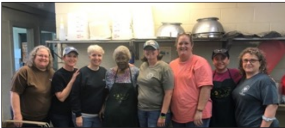
Some of our former staff came to volunteer.

Some of the projects were: recovering 3 decks on the back of cabins, building a dock down at the lake, cleaning out the Administration Building and World Mission Center, clearing the trails around camp, and preparing the Store for camping season.