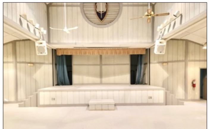
New floors in the Multipurpose Building.

Forty years of wear and tear on the Multipurpose Building floor had taken its toll and needed replacing. We were able to purchase a beautiful new floor because of generous giving from attendees at our WMU Missions Encounter and Annual Meeting and South Carolina Baptists. The Multipurpose Building has many uses during camping season, including daily worship services, camp activities, and Bible studies. During the off-season, the Multipurpose Building is also used for meetings and activities by groups.