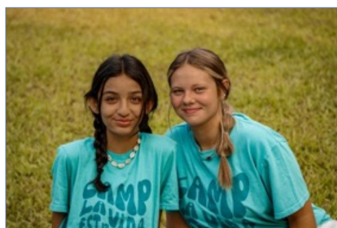
Friends building a stronger relationship with the Lord and each other.