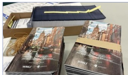
Prayer guides and envelopes.