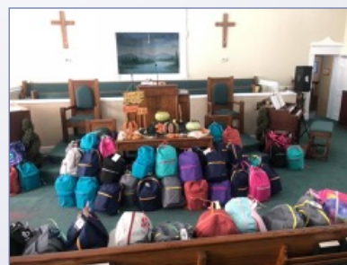
Christmas Backpacks are prayed over before distributing them.