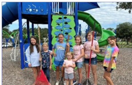
Cleaning up the playground.

The theme for the August 24, 2023, event was "Operation Education." Girls and boys across South Carolina served their local schools and communities as they demonstrated the love of God. A few churches that participated were: First Baptist, Honea Path; Oolenoy Baptist, Pickens; Fairview Baptist, Spartanburg; Deer Park, Charleston, and more! Other groups are planning a Children's Missions Day project later this year.