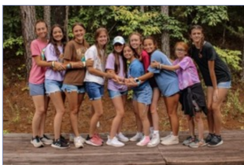
Make new friends and bring all your other friends too!