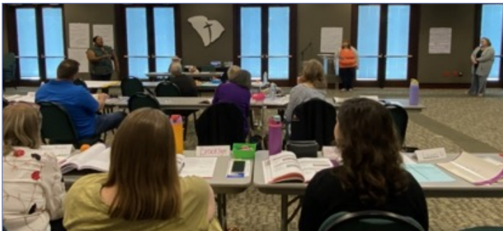
Participants worked together to research and present signs and symptoms of different mental health challenges throughout the training.

On May 24, 2023, SC WMU held a Mental Health First Aid training in Columbia. Twenty-one participants from across the state attended an eight-hour certification course to learn how to identify, understand, and respond to signs of mental health and substance use challenges. Through this training, participants became more educated and equipped to help those in their churches and communities who may be experiencing mental health challenges.