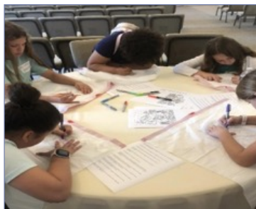
Ministry to residents through crafts.