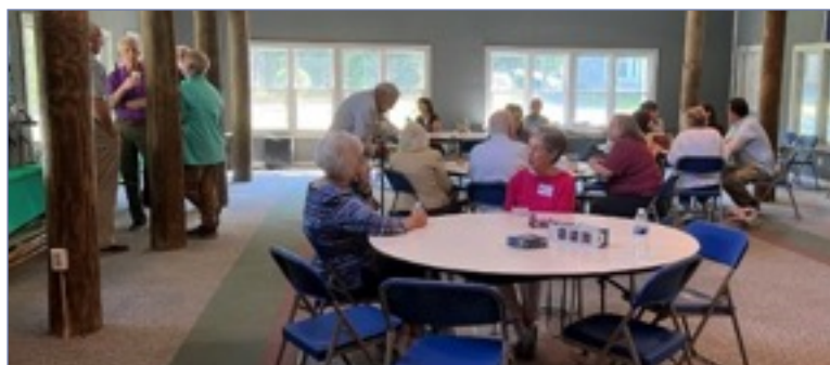
Some enjoy working on puzzles and playing games.