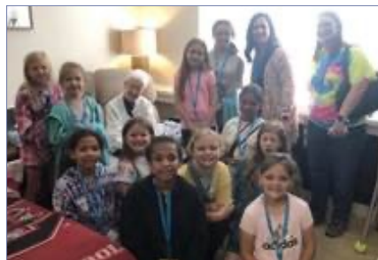
Visiting with residents in their rooms.

On April 22, 2023, 100 children and leaders with Girls in Action® and Children in Action® gathered in two locations for GA/CA Day in South Carolina. Our focus was Sharing God's Love as we ministered with residents at both of our SC Baptist Retirement Communities. Various activities were planned to help us know about Bethea (Darlington) and Martha Franks (Laurens) Retirement Communities. Several residents at each location helped lead and shared with the children. We toured the facilities and enjoyed songs, games, and crafts. We also prayed for these communities. Children participated in hands-on learning about Disaster Relief from teams representing PeeDee and Laurens Associations. It was a special day to hang out with our senior friends, eat a great lunch, and learn so much about different ministries around our state that are funded and fueled by our state missions offering named after Janie Chapman. The Retirement Communities staff, Camp La Vida SM staff, Disaster Relief Teams, and SC WMU SM helped plan and implement our day. An ice cream treat was enjoyed ending our time on a sweet note!