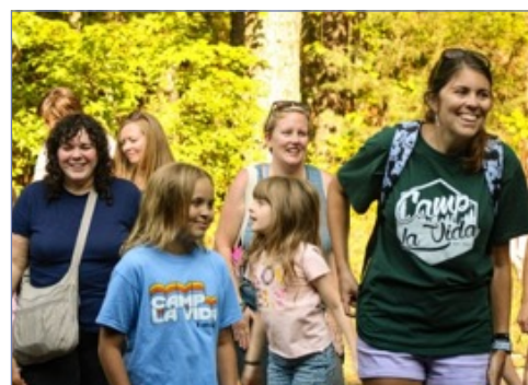
Mother/Daughter bonding time at Camp La Vida!