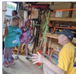
Learning about Disaster Relief.